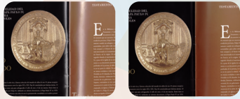
Glare control system